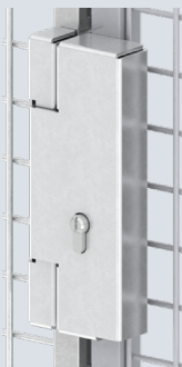
EURO CYLINDER LOCK