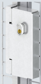
SCANDINAVIAN CYLINDER LOCK