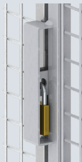
PAD LOCK PLATE

WE OFFER THREE DIFFERENT LOCKS , DEPENDING ON YOUR NEEDS.